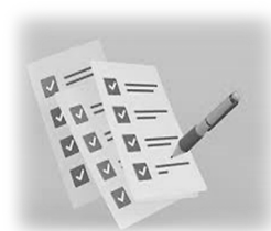
Figure 2. A questionnaire