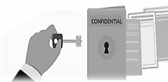
Figure 7. Cartoon of hand, lock and key representing confidentiality