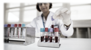
Figure 3. Scientist processing blood samples